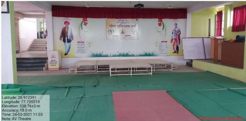
AV Theatre with Projector & Internet facility